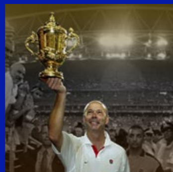
Sir Clive Woodward Director of Sport